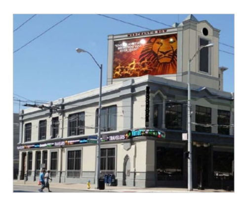
Key-Ads Inc.'s future downtown headquarters