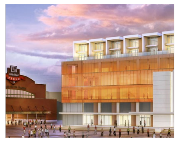
Proposed design of the Mendelson Building