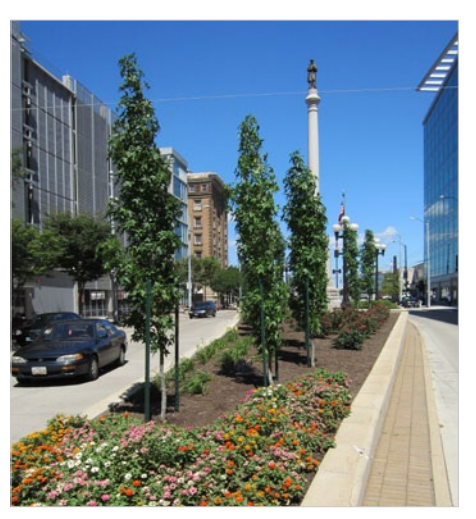
Private Fair Plaza