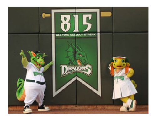
Dayton Dragons' mascots Heater and Gem celebrate the team's record-breaking season