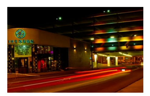
New lighting on and beneath the Transportation Center garage