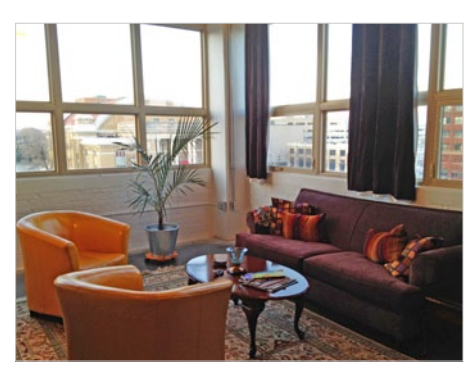
Vella Inc.'s new downtown office

the project's pilot phase in November 2011. To date, two businesses are looking to convert their temporary leases into traditional long-term leases while two other businesses were attracted downtown thanks to the project.