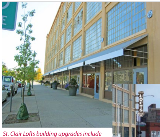
St. Clair Lofts building upgrades include modern awnings and a new sign for the property