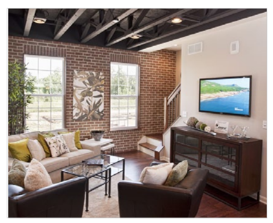
The living room of a Patterson Square townhome