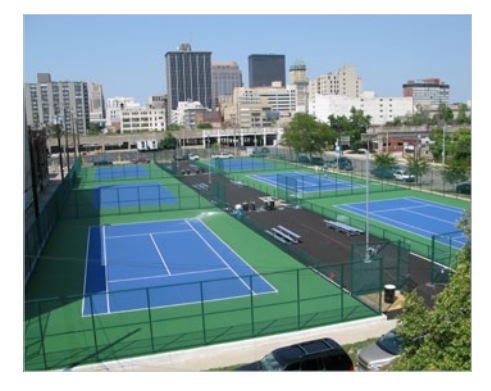
Chaminade Julienne's new Eagle Tennis Center